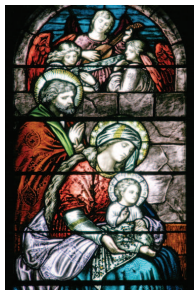
The Holy Family, Patrons of The Catholic Writers' Guild